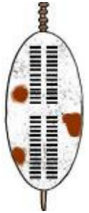
Illustration – Men at Arms 57 D1

IsAngqu was part of uSuthu in 1856. IsAngqu was present as part of uNodwengu Corps at Isandlwana (22 nd January 1879), Kambala (29 th Match 1879), Ulundi (4 th July 1879).